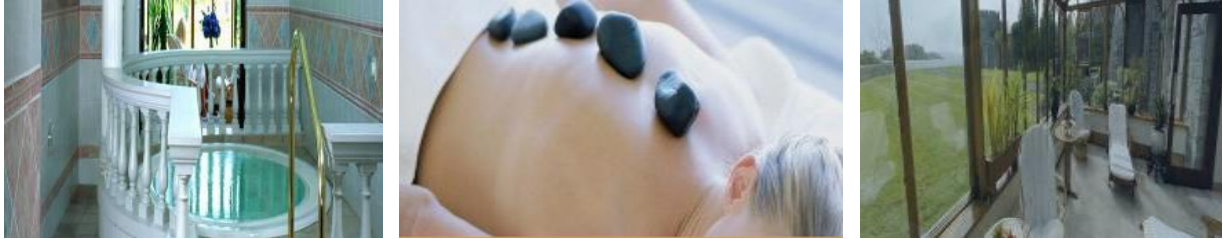
The Spa at Ashford

Transfer to Galway City of Tribes for lunch