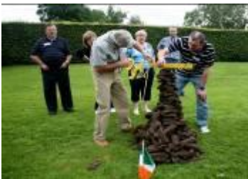
“hands on” Turf Cutting and turf stacking!

Along the way we will arrange a few “surprises” :