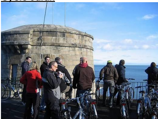
Discover Dublin Bay by bike!