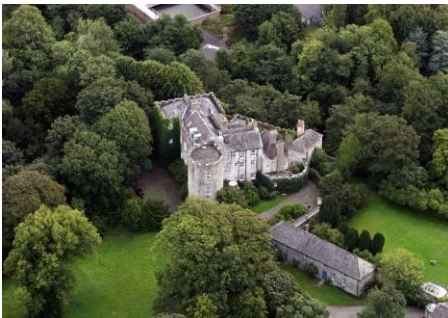
Leixlip Castle – home of Lord Desmond Guinness